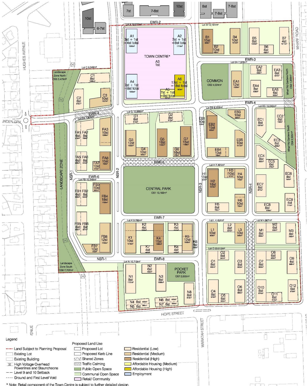
Figure 2 – Proposed Melrose Park Masterplan