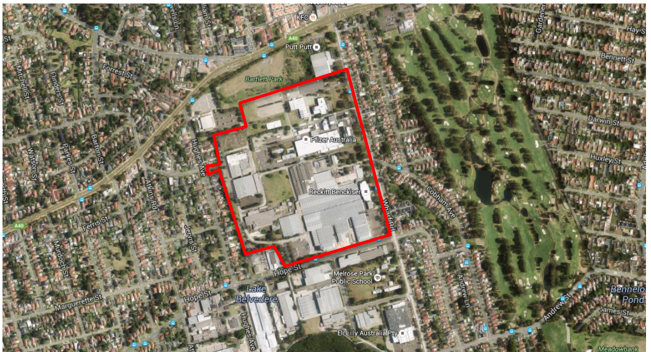
Figure 1 – Site Locality Plan

The site is currently developed and in use for light industrial and commercial purposes. The site covers an area of approximately 25 Ha. The site is surrounded by low density residential housing to the east and west, Victoria Road to the north and existing light industrial and Melrose Park Public School to the south (refer to Figure 1 ).